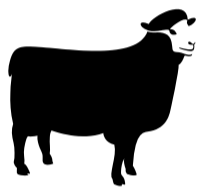
4-H/FFA Sheep Show Show Arena 8 AM